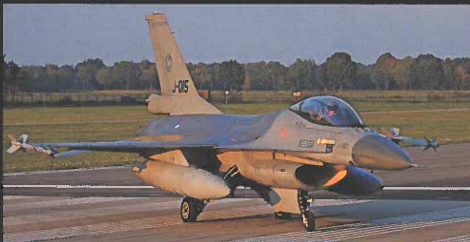
Main photo: SG Volkel tried something new for this photoshoot using the aircraft and runway to good effect.

An operational F-16AM (MLU) Fighting Falcon, J-015, from 312 Sqn with inert/training AIM-9L Sidewinder air-to-air missiles on the wingtips and a drop tank on each wing was the star of the show. The sunset/night shoot started at 5pm when photographers were bussed out to the awaiting aircraft at the threshold of Runway 24R.